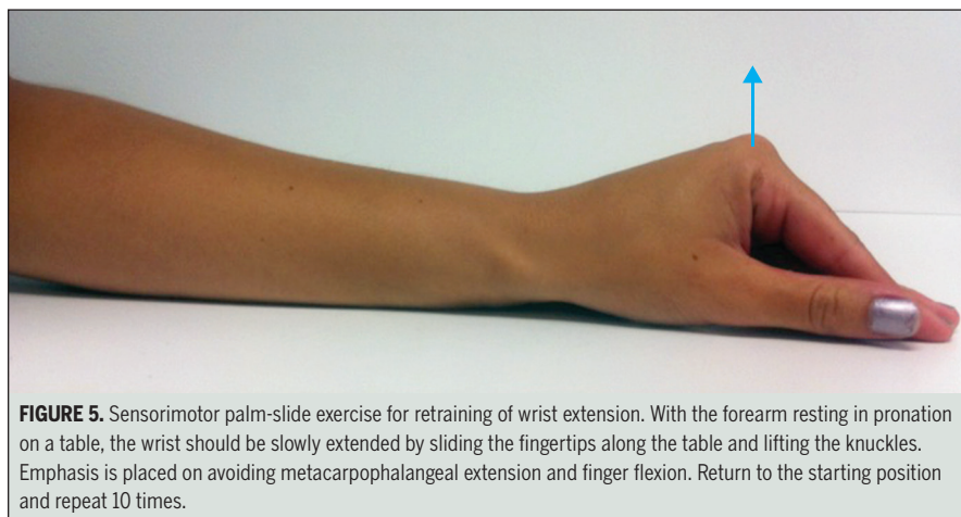
FIGURE 5. Sensorimotor palm-slide exercise for retraining of wrist extension. With the forearm resting in pronation on a table, the wrist should be slowly extended by sliding the fingertips along the table and lifting the knuckles. Emphasis is placed on avoiding metacarpophalangeal extension and finger flexion. Return to the starting position and repeat 10 times.