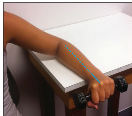
FIGURE 6. Wrist extension exercise can be performed over the edge of a table with elastic tubing or free weights. Isometric holds (30-60 seconds in duration) are advocated for reactive or irritable tendinopathy, while concentric and eccentric actions should be performed slowly (4 seconds for each direction), completing 2 to 3 sets of 10 repetitions for patients with less irritable or degenerative tendinopathy. Emphasis is placed on maintaining neutral radial-ulnar deviation of the wrist (by aligning the middle metacarpal bone with the long axis of the forearm). Progression may be achieved by increasing load or performing the exercises with greater elbow extension.

interest, there is growing evidence that injection of autologous blood or platelet-rich blood products is not effective in treating LET. 32,62